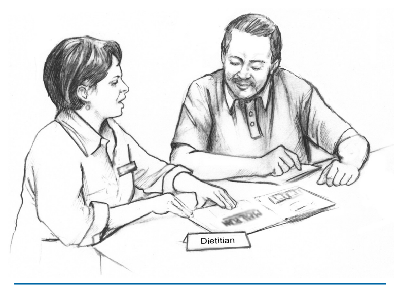
When you see members of your health care team, ask lots of questions. Prepare a list of questions before your visit.

When you see members of your health care team, ask lots of questions. Prepare a list of questions before your visit. Be sure you understand everything you need to know about taking care of your diabetes.