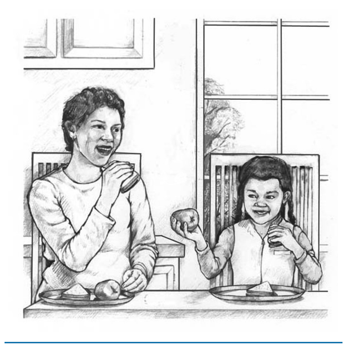
You can learn how to take care of your diabetes.

Share this booklet with your family and friends so they will understand more about diabetes. Also make sure to ask your health care team any questions you might have.